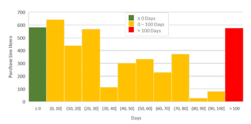
Figure 3: Analysis of goods required versus goods received dates