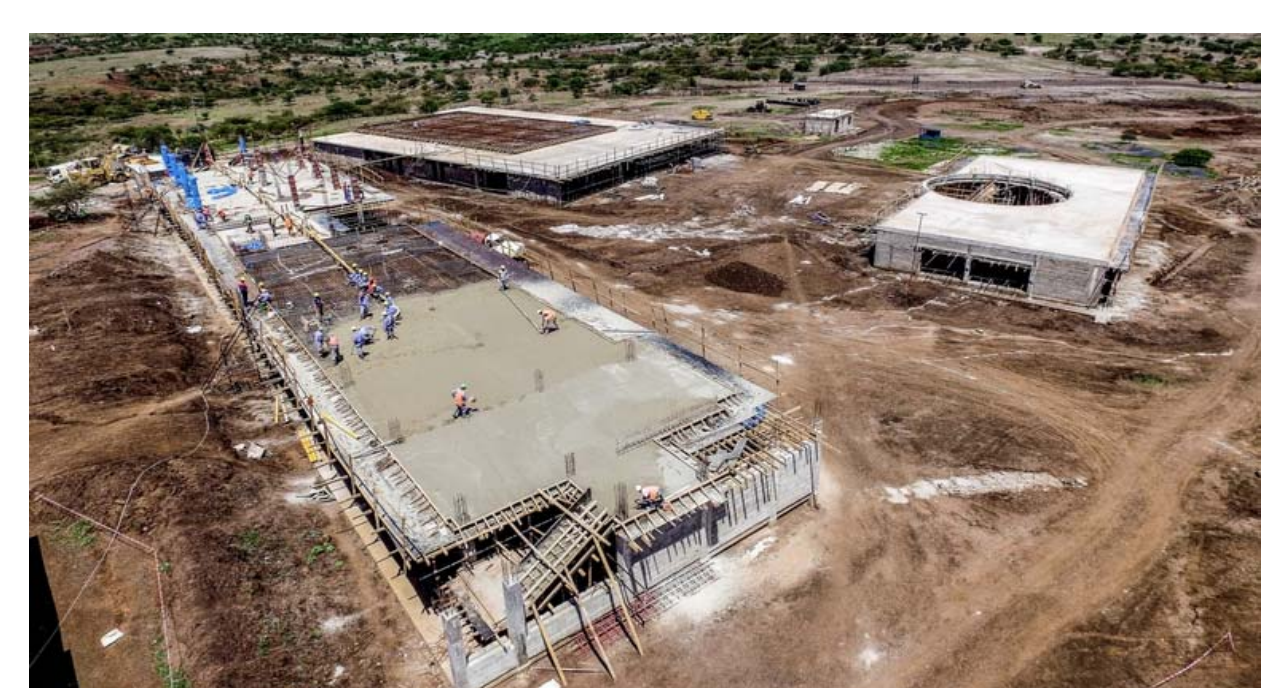
Picture 1: View of the construction site in Arusha (31 December 2015)