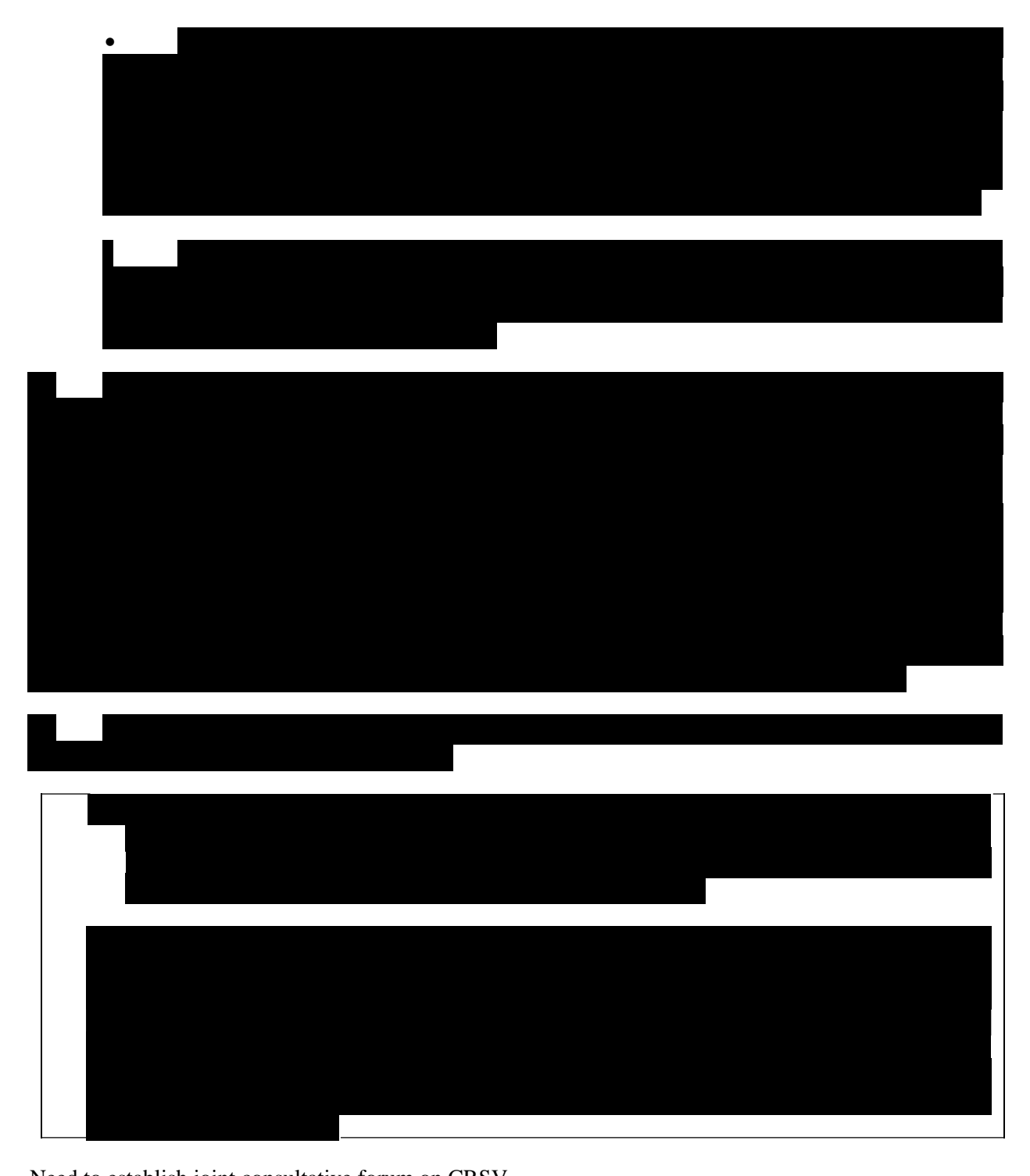
Need to establish joint consultative forum on CRSV

37. The Provisional Guidance Note for the implementation of Security Council resolution 1960 (2010) on CRSV requires UNSOM to establish a joint consultative forum on CRSV to engage a broad range of stakeholders, including the MARA Working Group, United Nations Country Team and representatives of local and international non-governmental organizations, health service providers and host government institutions to enhance data collection and analysis.