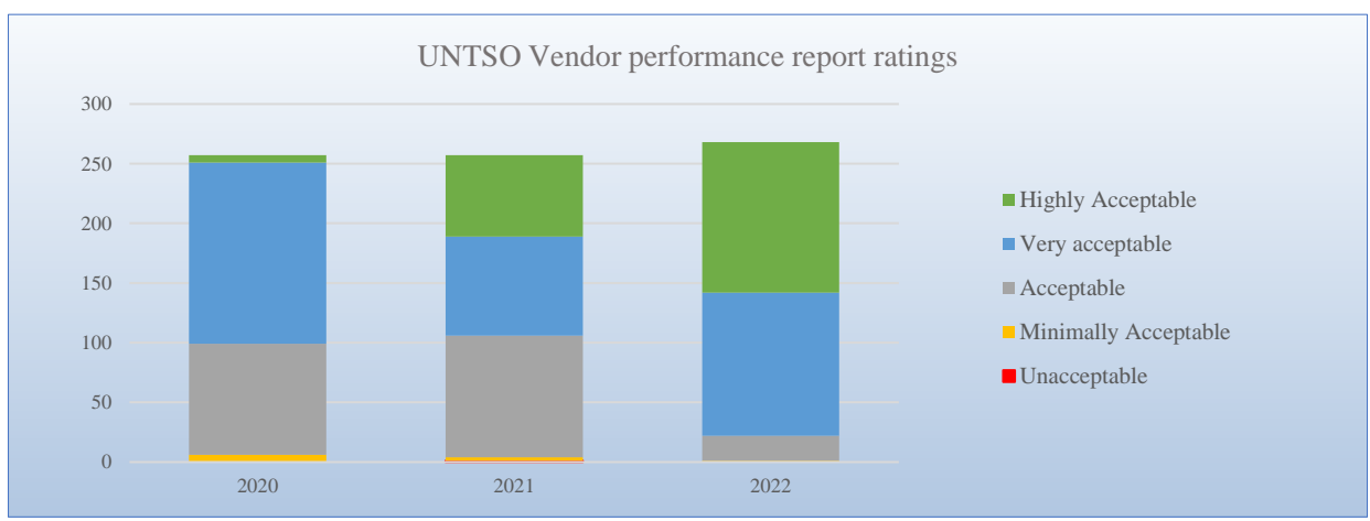
Figure 2: Average vendor performance ratings in the Contract Performance Reporting Tool