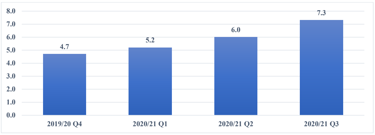
Chart 3 UNMISS slow-moving inventory for the period 30 June 2020 to 31 March 2021 (in millions of United States dollars)